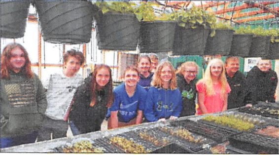
Council Middle School students check on the pollinator plants they grew from seed in the Council School greenhouse as part of the Pollinator Project.

ASWCD partnered with the Council School District and the Council Community Garden for the Pollinator Project. Kids in kindergarten through seventh grades raised a variety of flowering plants that attract a variety of pollinators in the Council School District greenhouses. Seventh graders also created brochures describing each plant, its habitat preferences, and what pollinators they commonly attract. Some plants were transplanted into the Community Garden for the demonstration pollinator garden, while the others were given away at the Elementary Garden Club Plant Sale. Donations generated from the plant sale will be used to buy seed and soil for next year. The brochures were given out with the flowers and posted on the ASWCD website.