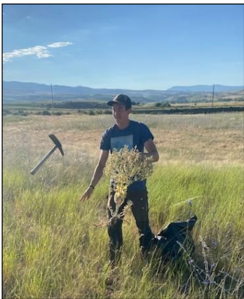
A CERC worker eradicates another Med sage plant near the Weiser River Trail in Adams County in July 2023.

In 2023, the District contributed $2800 to employ three Council high school students plus a supervisor. The funds allowed CERC to work for a week in July for both Adams Cooperative Weed Management Area and Adams Soil and Water Conservation District. The crew dug and bagged Mediterranean sage ( Salvia aethiopis ) from several private properties bordering the Weiser River Trail and pulled houndstongue ( Cynoglossum officinale ) along the East Fork Ditch near Shingle Flat Campground.